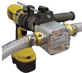
for antifreeze in the cooling circuit of the engine: drill pump