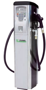
for fuelling: fuel pumps, diesel fuel dispensers and transfer units