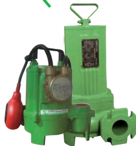
for condensate: waste water pumps (ATEX certified)