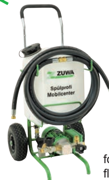
for easy filling and flushing of the cooling circuit: FLUSH PRO