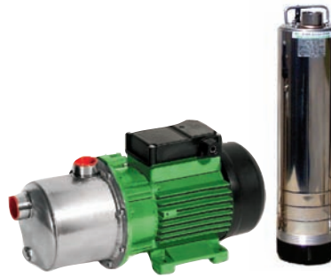
for water supply and pressure boost: centrifugal pumps, well pumps