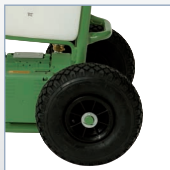
all-terrain pneumatic tires