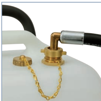
return hose connection in 90° angle