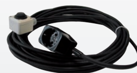
Remote Control with 10 m cable and ON/OFF switch