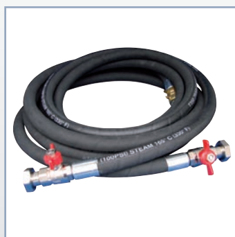
hoses with ball valves, crimped fittings and swivel connector