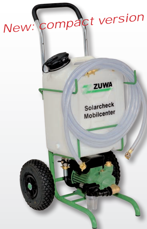
Solarcheck Mobilcenter P80