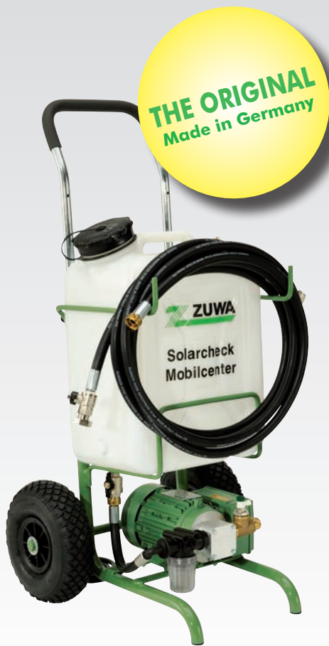
Solarcheck Mobilcenter UNISTAR