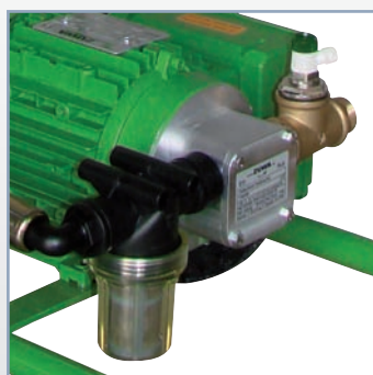
pump UNISTAR with filter and pressure relief valve