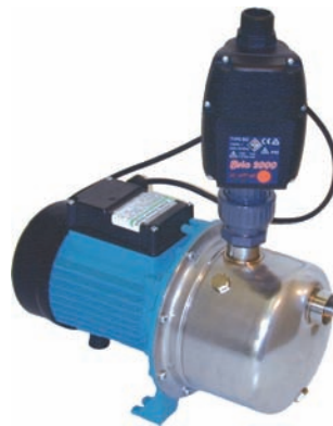
JET 100/E INOX